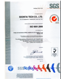
SGS ISO 9001 Certificate TW12/11128